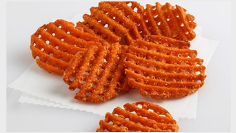
LAMB WESTON Sweet Potato Criss Cuts