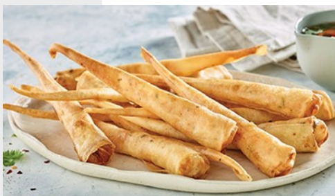
MARKWELL Prawn Twisters