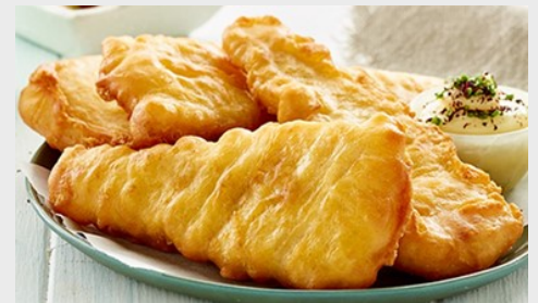
MARKWELL Tempura Fish 85g