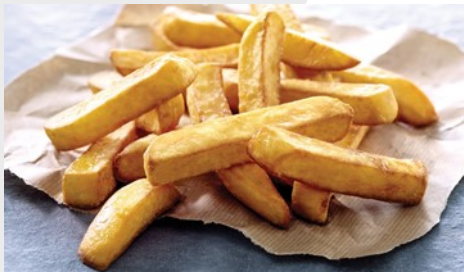
LAMB WESTON Stealth Chunky Fries 16 x 18mm