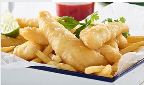
MARKWELL Tempura Petite Whiting 20g