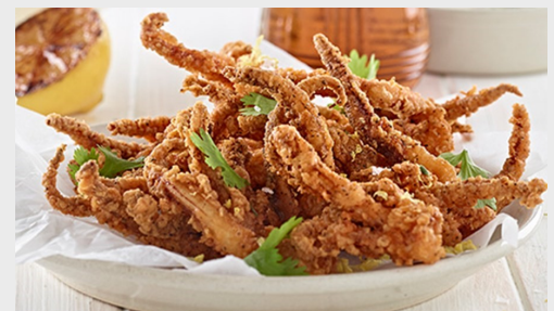
MARKWELL Crispy Squid Tentacles