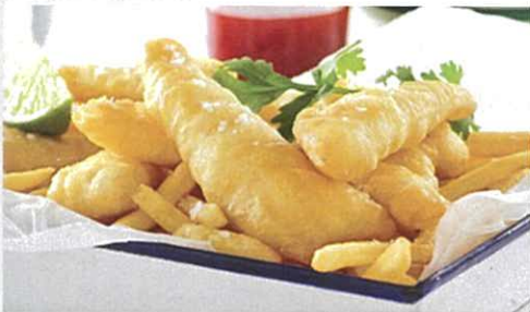
MARKWELL Tempura Petite Whiting 20g