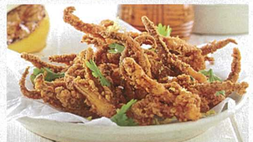
MARKWELL Crispy Squid Tentacles