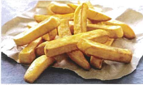
LAMB WESTON Stealth Chunky Fries 16 x 18mm