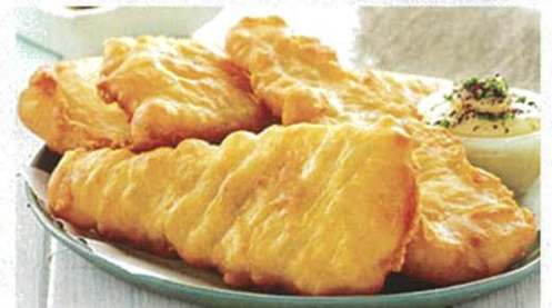
MARKWELL Tempura Fish 85g