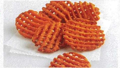
LAMB WESTON Sweet Potato Criss Cuts