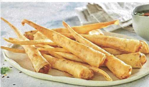
MARKWELL Prawn Twisters